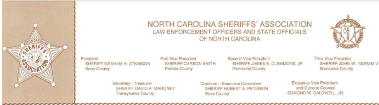
Exhibit A: Letter of Support from the North Carolina Sheriffs' Association